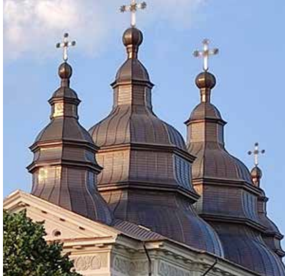
Frumoasa Monastery, Iași / KME Natural copper sheets