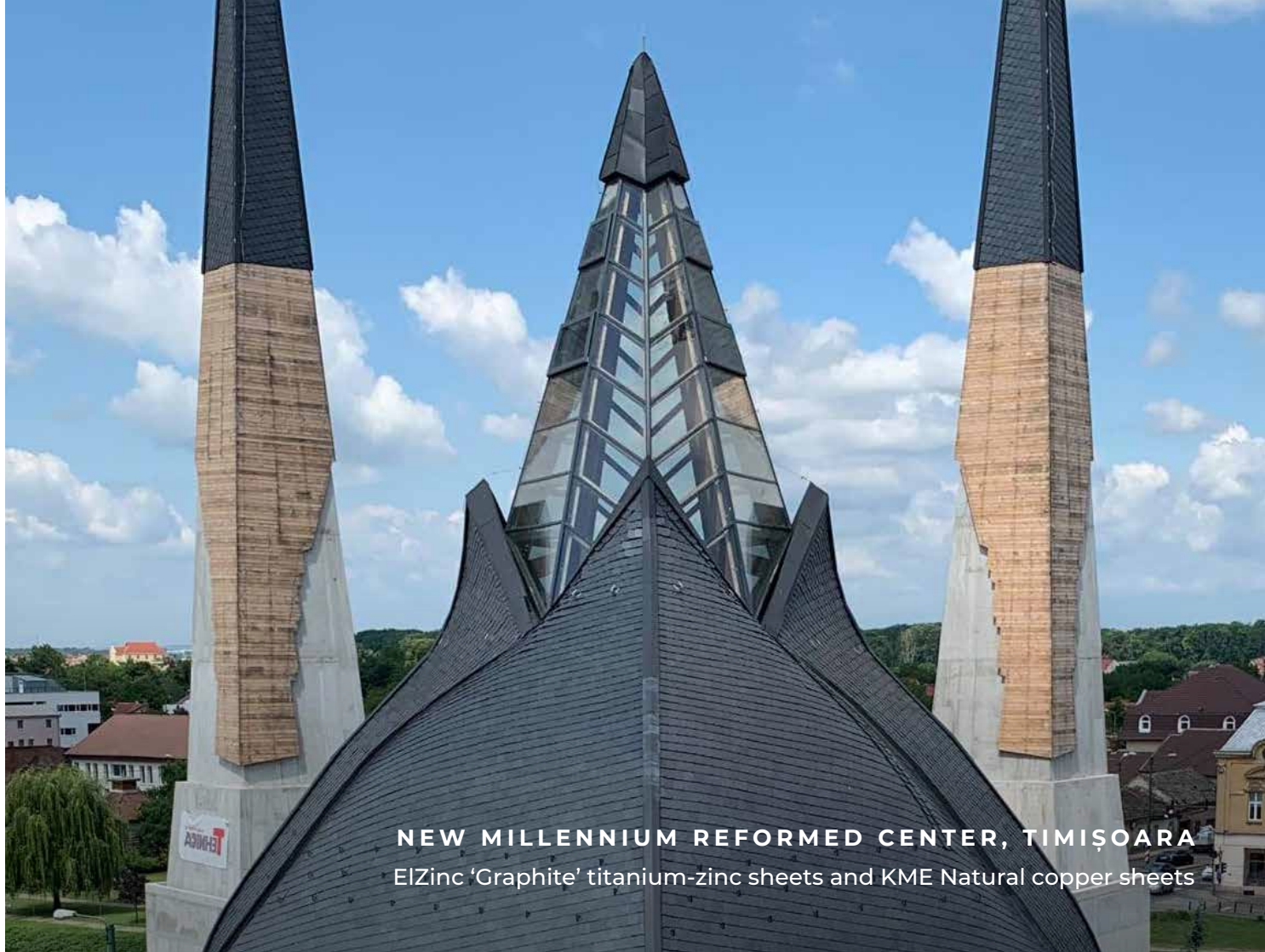
NEW MILLENNIUM REFORMED CENTER, TIMIȘOARA ElZinc 'Graphite' titanium-zinc sheets and KME Natural copper sheets