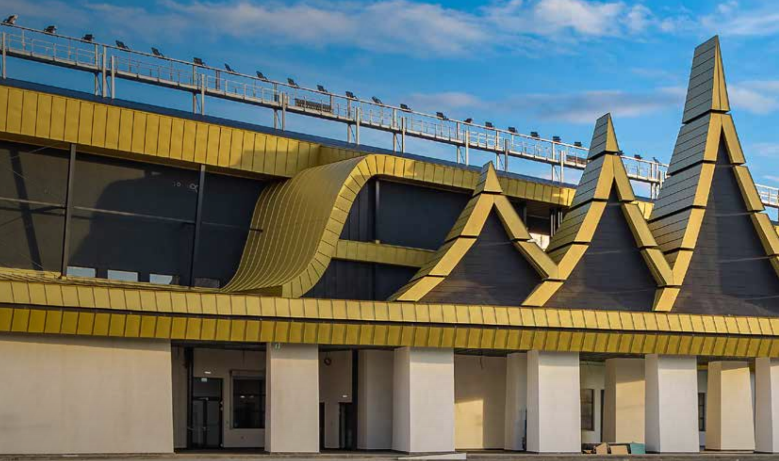
SEPSI OSK STADIUM, SFÂNTU GHEORGHE ElZinc 'Rainbow Gold' and 'Graphite' titanium-zinc sheets