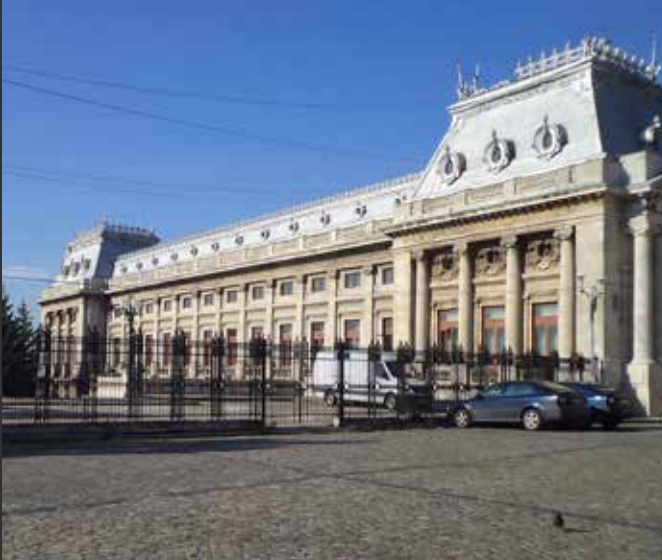
Palace of the Patriarchate, Bucharest