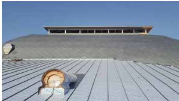
Maria Filotti Theatre, Brăila EIZinc 'Slate' titanium-zinc sheets