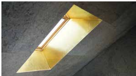
Castle Hotel Daniel, Baraolt KME Natural copper sheets and interior design